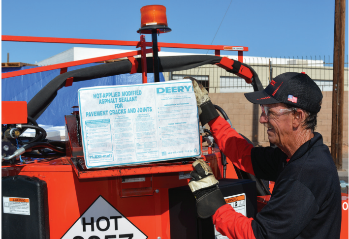
Packaging Details: Block weight 30 lbs. each • 70 blocks per pallet Pallet weight 2,100 lbs. net • Dimensions 12"W x 18"L x 3"H